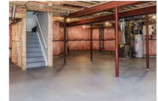
Walkup and walkout basements available. 9' basement ceiling height.