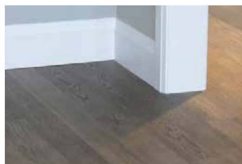
Engineered hardwood in kitchen/breakfast, living room, dining room, great room, family room, study, office, and main floor hallway as per plan.