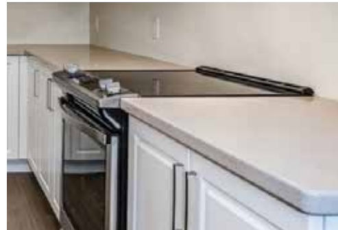
Solid surface countertops in kitchen to be selected from vendor's standard samples.