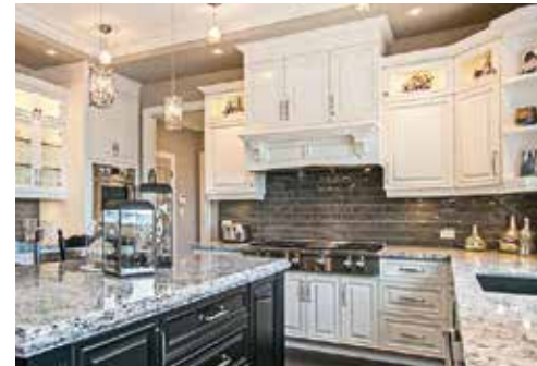
Custom designed kitchen cabinetry offered in a variety of finishes, styles and colours from vendor's samples.