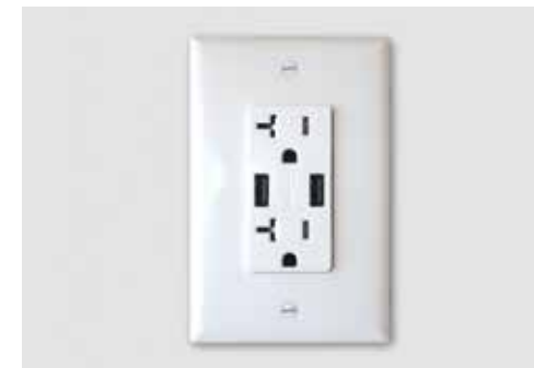
Two USB charging outlets for charging phones/tablets, as per plan.