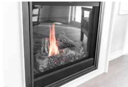
Direct vent gas fireplace (with electronic ignition) with a white mantle finish, as per plan.