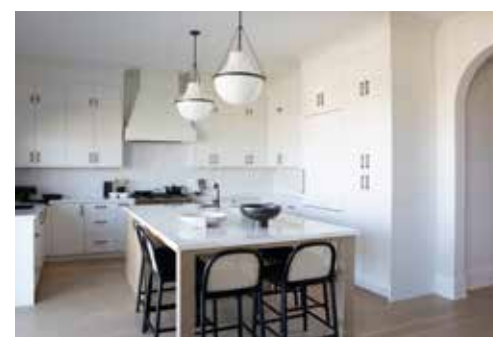
9' ceilings on main floor on 36' lots, as per plan. 10' ceilings on main floor on 40' lots, as per plan.