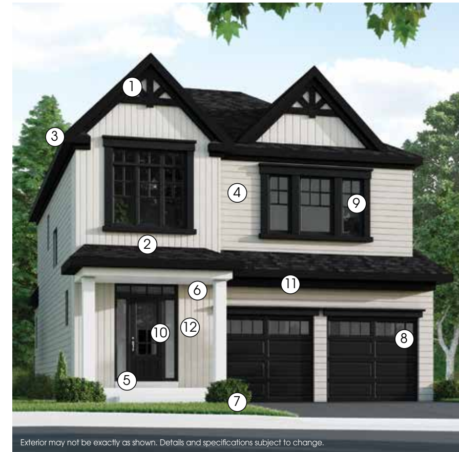
Exterior may not be exactly as shown. Details and specifications subject to change.

Below is a partial summary of what you can expect with your new Jeffery home, all backed by a Taron warranty coverage plan.