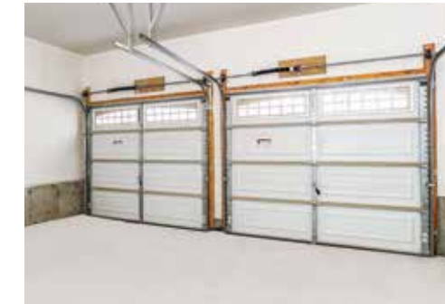
Garage interiors are gas-proofed. Steel sectional roll up embossed garage doors included, as per elevation.