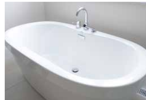
4-piece bathroom will include an acrylic stand alone tub, as per plan with handheld shower.