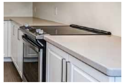
Solid surface countertops in kitchen to be selected from vendor's standard samples.