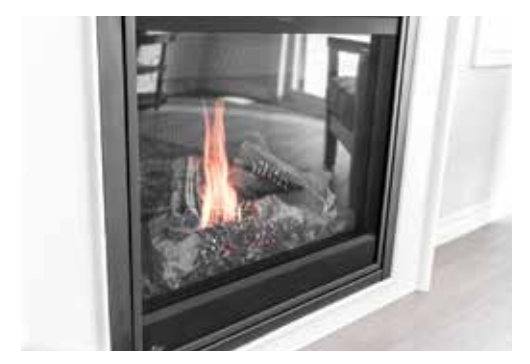
Direct vent gas fireplace (with electronic ignition) with a white mantle finish, as per plan.