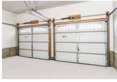
Garage interiors are fully drywalled, gas-proofed and primed finish. Steel sectional roll up embossed garage doors included, as per elevation.