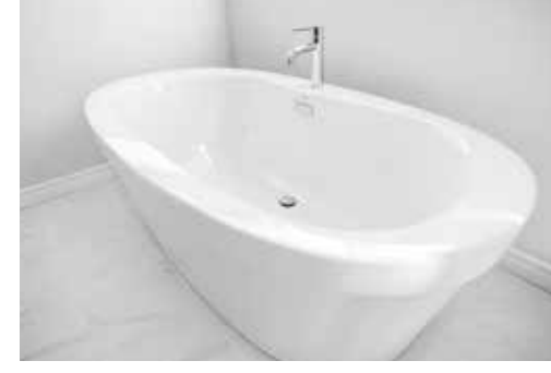
4-piece bathroom will include an acrylic stand alone tub, as per plan with handheld shower.