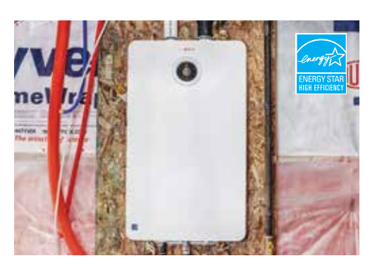
High efficiency hot water tank (not a rental). Compact in size, these virtually eliminate standby heat loss caused by water sitting in storage style water tanks.