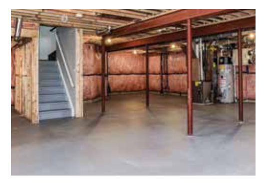
Walkup and walkout basements available. 9' basement ceiling height. Basement floor sealed and painted, ready for your moving boxes.