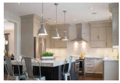
9' ceilings on main floor on 36' lots, as per plan. 10' ceilings on main floor on 40' lots, as per plan.

At Jeffery Homes, we pride ourselves on offering new home buyers standard features everyone loves. Everything you see here and more, is all backed by a Tarion warranty coverage plan.