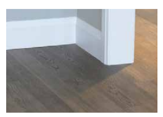
Engineered hardwood in living room, dining room, great room, family room, study, office, main floor hallway and second floor upper hallway, as per plan.