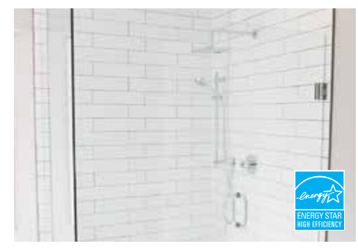
Separate shower stall (where applicable) to include ceramic tile with shower light, frameless glass surround, and ceramic tiled ceiling, as per plan.