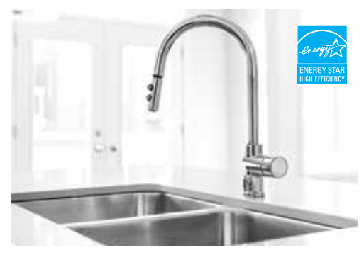
Double stainless steel undermount sink with energy efficient single lever upgraded faucet featuring pullout spray.