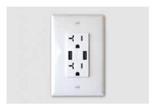
Two USB charging outlets for charging phones/ tablets, as per plan.