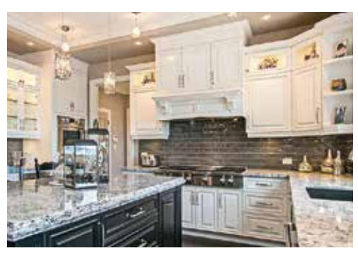
Custom designed kitchen cabinetry offered in a variety of finishes, styles and colours from vendor's samples.